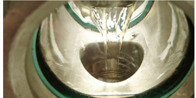
Fig. 2: Final product