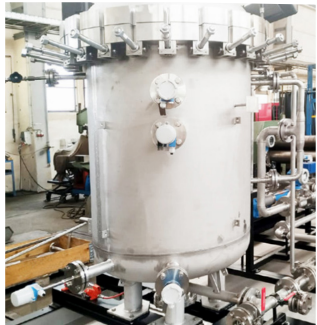
Fig. 1: LEPD pilot plant of EDL based in Leipzig during the assembly

In the patented process, the polymer is gently dissolved in the base oil at a pressure of up to 10 bar and at temperatures below 100 °C in a liquefaction chamber under inert gas. The lube oil flows through the liquefaction chamber, thus getting enriched with polymer up to the requested portion.